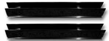
2 Strut Brackets